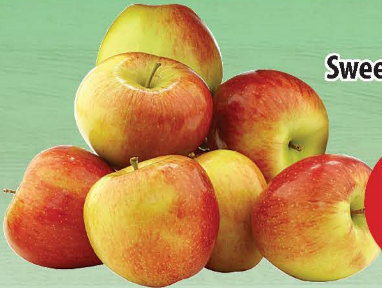
Sweetie Apple Manzana Dulce