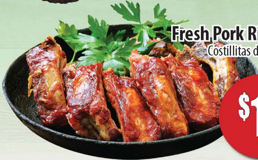
Fresh Pork Riblets Costillitas de Puerco