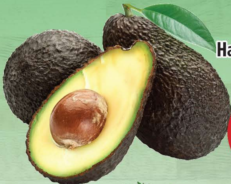
Hass Avocado Aguacate Hass